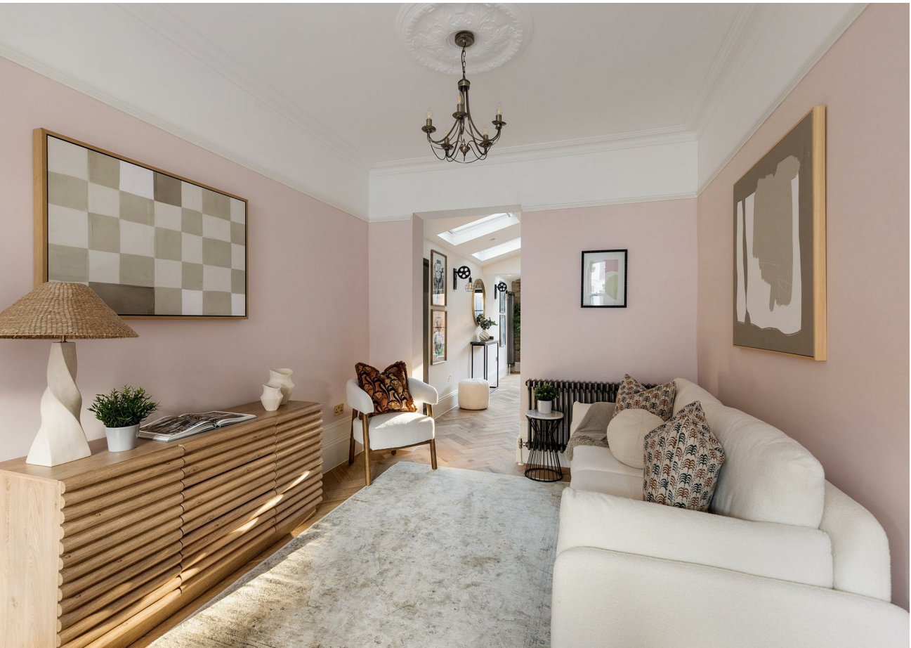
Garden Room 9'8" x 8'2"